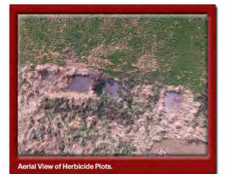
Aerial View of Herbicide Plots.

The herbicide mix in 2015 was definitely a success.